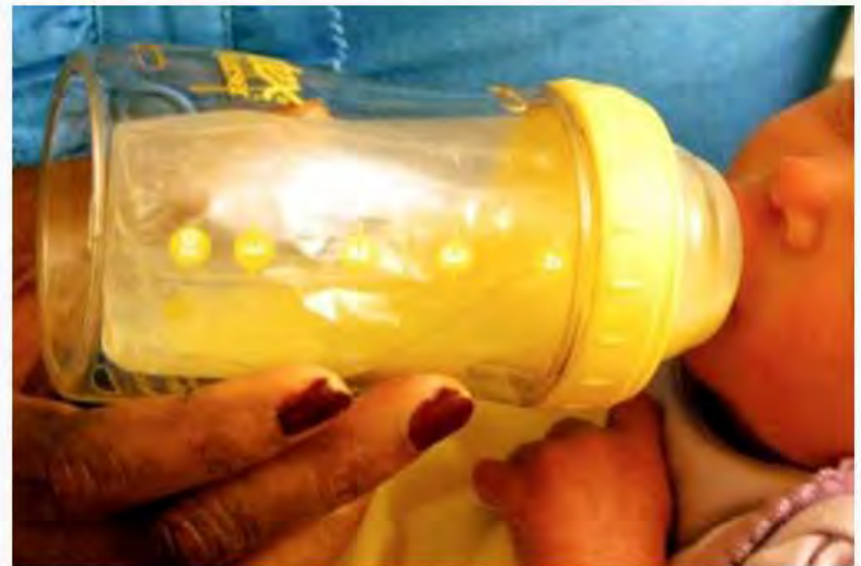
PHOTO: The demand for baby formula in China represents a massive opportunity for the dairy industry, analysts say.

In the past two years, Australian dairy companies have spent or plan to spend more than $1.5 billion building new or upgrading existing dairy factories.